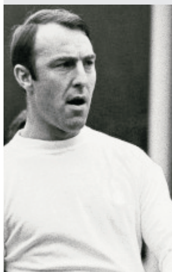
Jimmy Greaves. England's goalscoring legend comes to Penkridge

Please contact Pete Spillard 07768 632 093